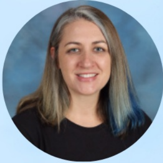
Ryann Scott Theater