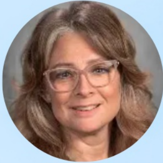
Cassie West Cafeteria