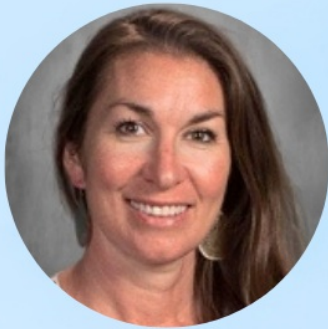
Katie Keene Makerspace